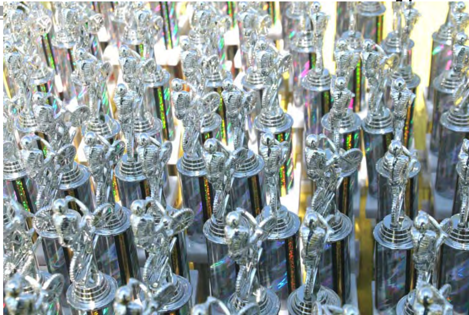
Above: A lot of silverware up for grabs at the Airdrie International.