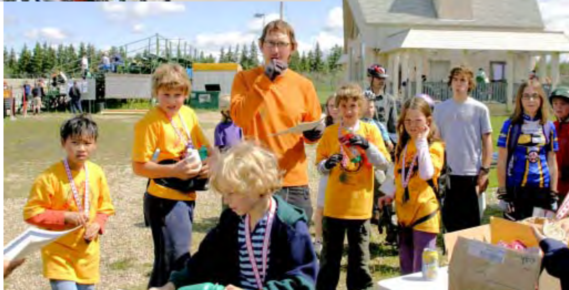
Right: Sprockids get their medals on completion of the program operated by Juventus CC. Info at http://www.juventus.ab.ca/sprockids/ sprockids%20Info.htm