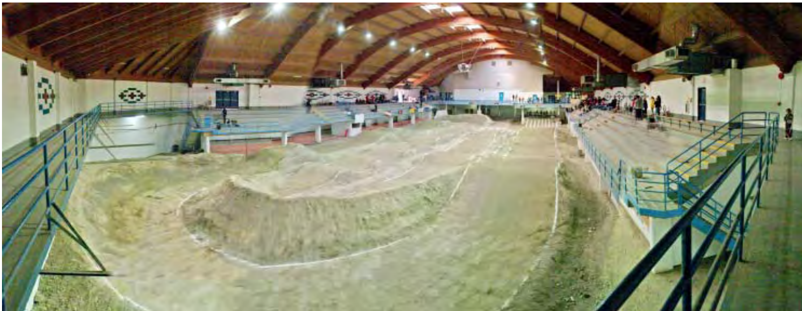
Above: This excellent panorama of the Morley indoor track is from the Alberta BMX site http://www.albertabmx.com/

A supplement to the Alberta Spin magazine