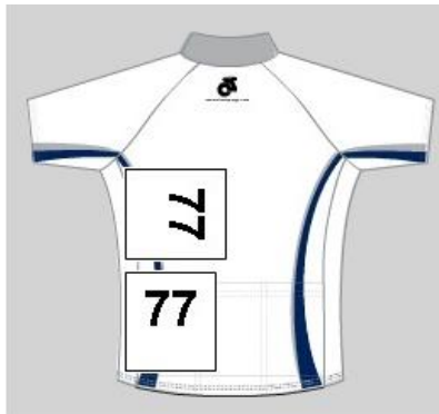
Left Pocket & Left Ribcage

Racers must compete with both body numbers for all events as shown below.